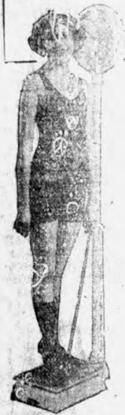
Note:—IRONIZED YEAST is sold at all Drug Stores on our guarantee of complete satisfaction from the very first package or your money refunded.

Ironized Yeast's Measurements Taken before and after 22 day test of Ironized Yeast Weight 10 1/2 lbs. 11 1/2 lbs. Ext. 30 in. 32 1/2 in. Chest 32 in. 34 1/2 in. Arm 12 1/2 in. 13 1/2 in. Neck 12 1/2 in. 13 1/2 in.