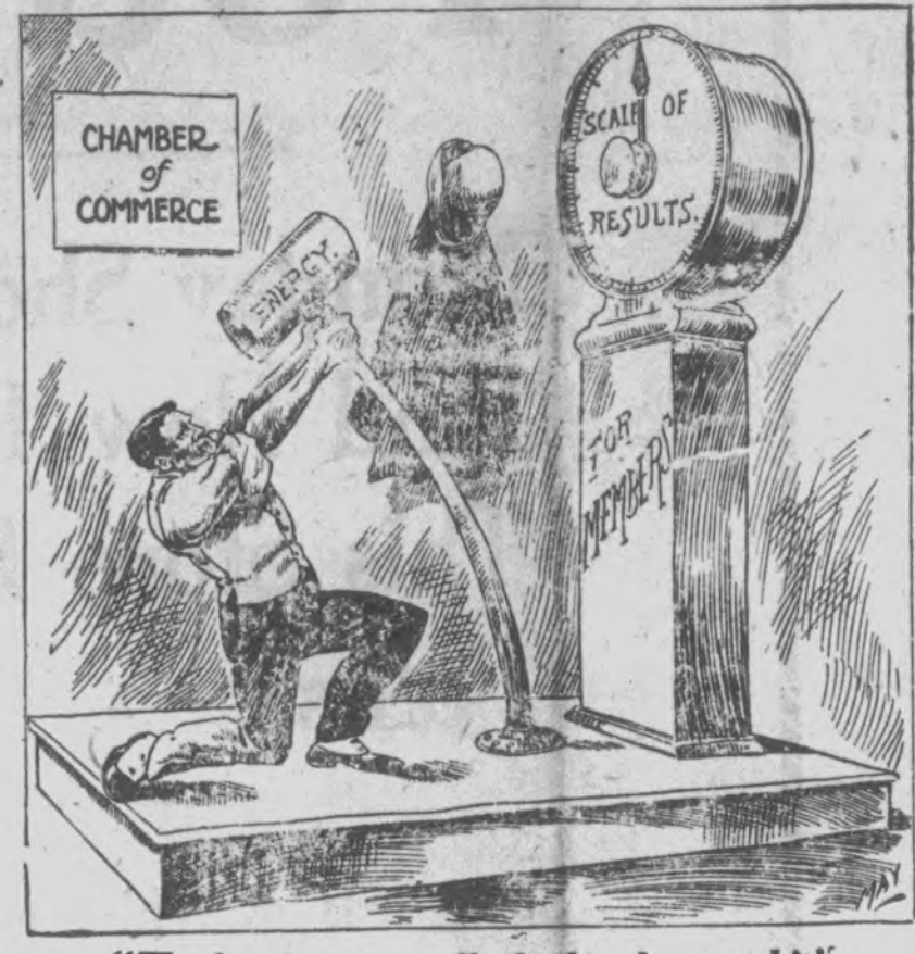
"The harder you pull, the harder you hit"