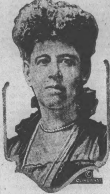
Miss Mabel Boardman, noted American Red Cross leader, has been named by President Wilson commissioner of the District of Columbia. She is a Republican.