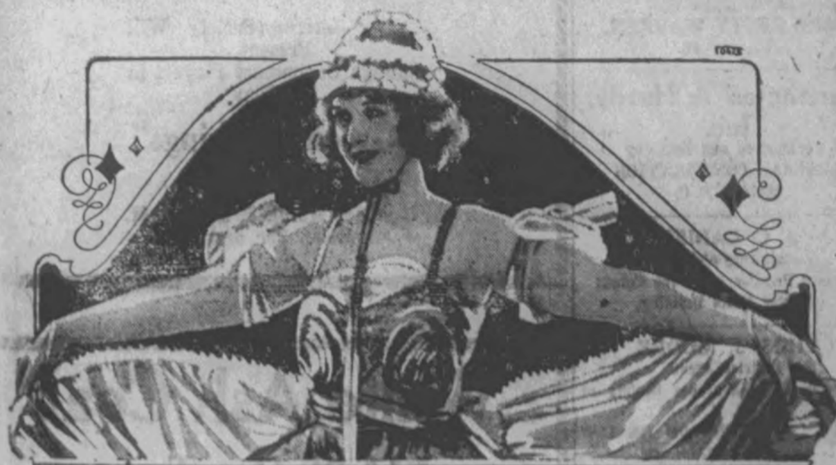
Billie Burke in "The Education of Elizabeth" A Paramount Picture

Coming! TO WHITE'S THEATRE SOON Cecil B. DeMille's Newest Production. 'Forbidden Fruit'