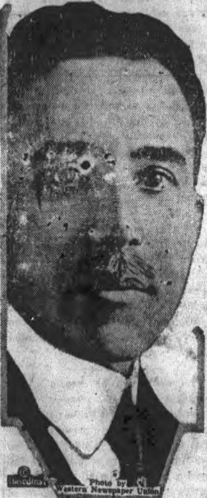
Dr. Jose Esperanza Suay is minister of finance of Salvador and one of that republic's leading citizens.

Defeated Candidate for Presidency Expresses Optimism in Party Future.