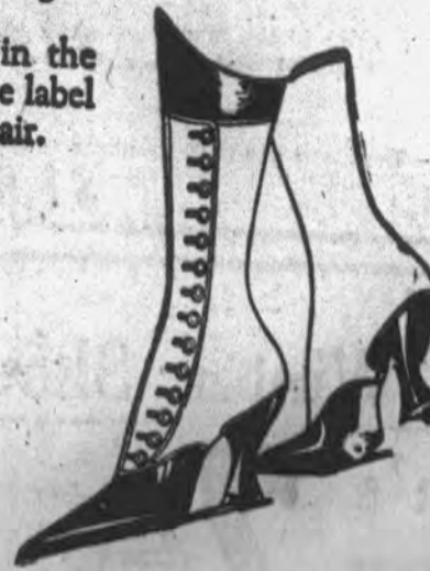
No buckle—will not pull away front or back

We have every size in the genuine, the Tweedie label sewed inside each pair.