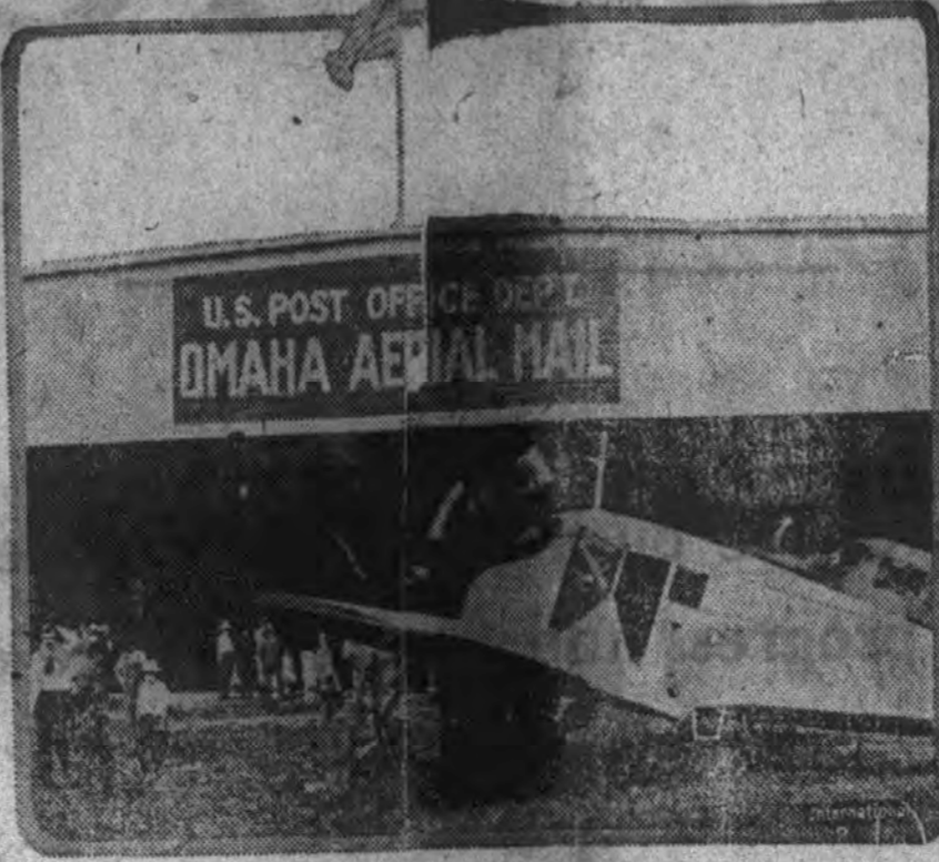
The monumental air mail hangar at Omaha, one of the stops in the New York to San Francisco air service.