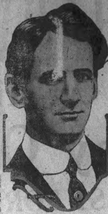
Terence MacSwiney, lord mayor of Cork, who, starving himself to death in a London prison, said: "I am confident my death will do more to smash the British empire than would my release."