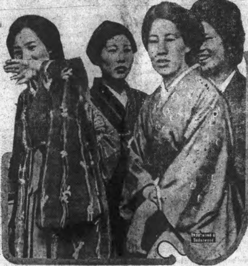
Here are some of the "picture brides," just arrived from Japan, who were questioned in San Francisco by the congressional immigration committee that has been inquiring into California's complaints against Japan. Scarcely any of the girls questioned had seen the men they came to marry. It was said this might be the last lot of "picture brides" to arrive in America.