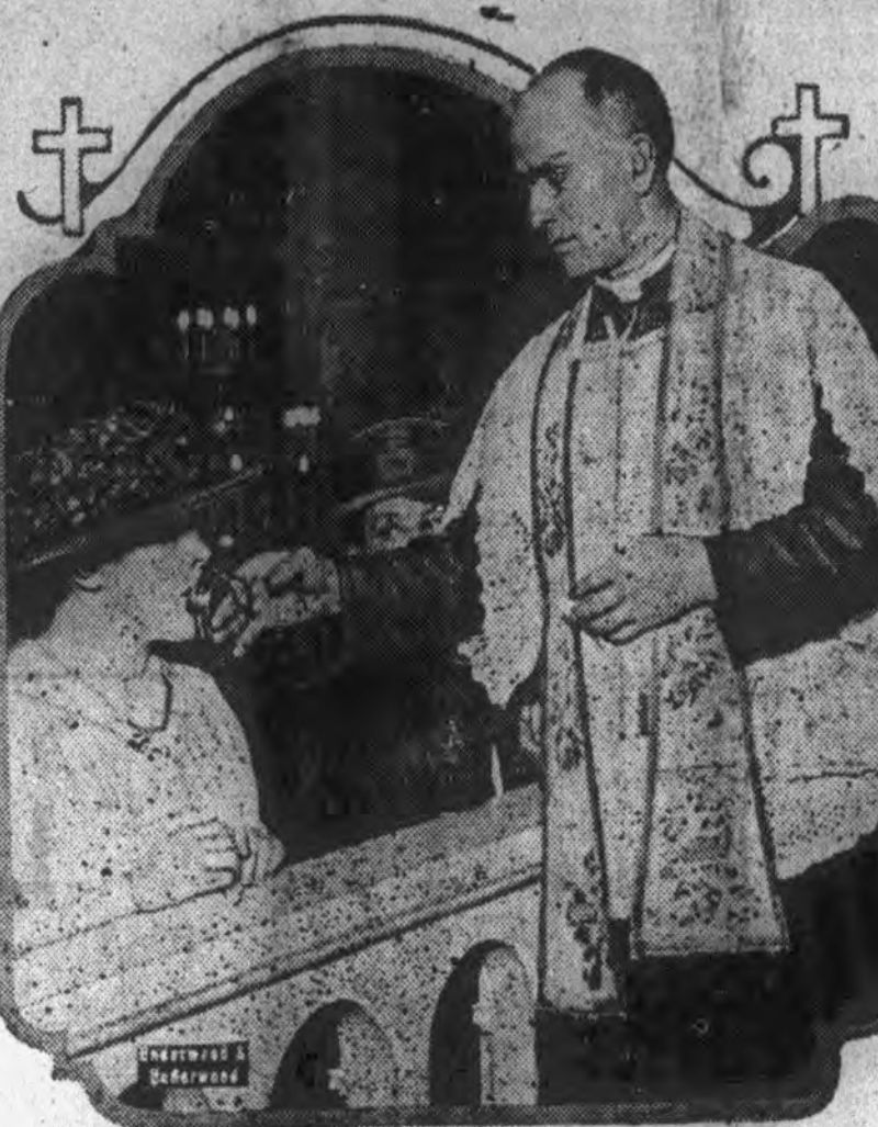
During the novena at the Church of St. Jean the Baptiste in New York, many pilgrims, like the one here-pictured, kissed the relic of St. Anne, to be cured of ailments.