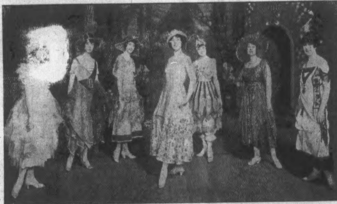
Baby Doll Chorus with Dan Cupid Co., White's Theatre Tomorrow Night.