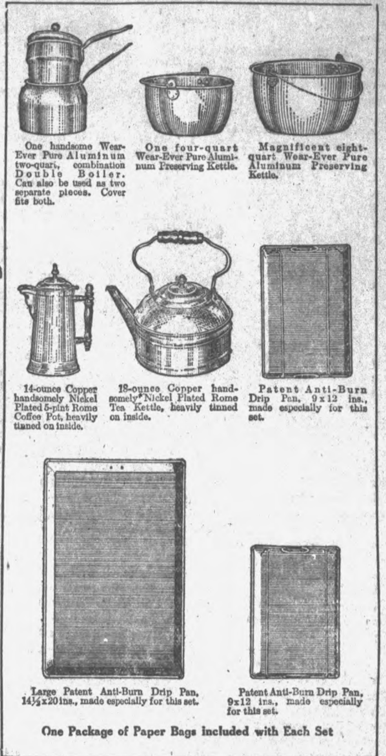
One handsome Wear-Ever Pure Aluminum two-quart, combination Double Boiler. Can also be used as two separate pieces. Cover fits both.