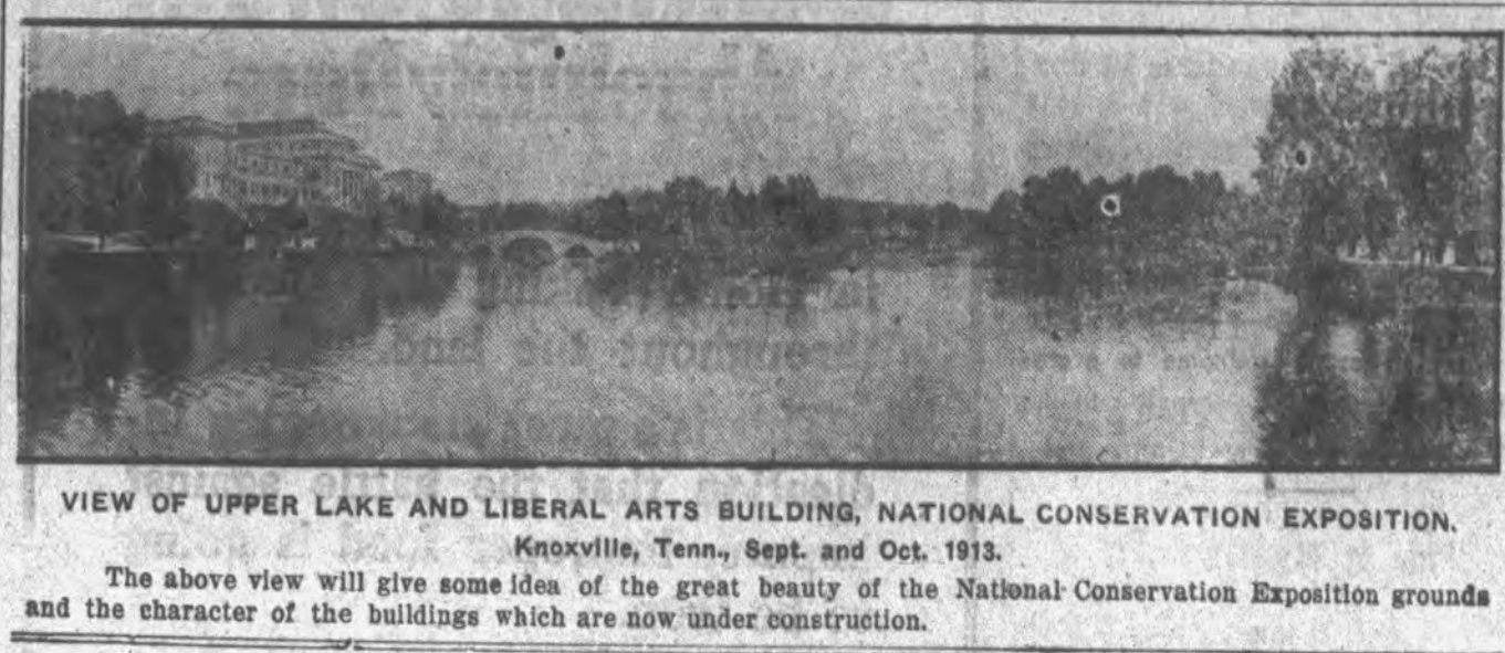
VIEW OF UPPER LAKE AND LIBERAL ARTS BUILDING, NATIONAL CONSERVATION EXPOSITION, Knoxville, Tenn., Sept. and Oct. 1913. The above view will give some idea of the great beauty of the National Conservation Exposition grounds and the character of the buildings which are now under construction.

GOVERNOR BALDWIN ISSUES PROCLAMATION BUSINESS HAS NOTHING TO FEAR UNDER THE ADMINISTRATION TO TAKE OFFICE NEXT MARCH