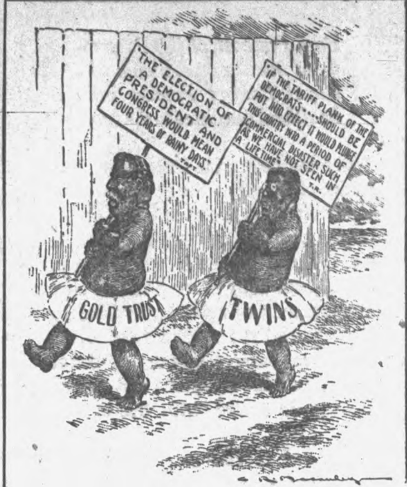
—Macaulay in New York World.