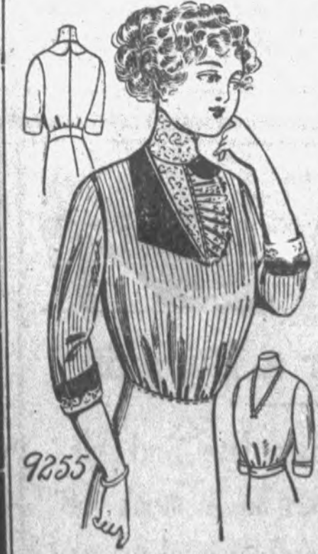
9255. A CHARMING DESIGN

Ladies Waist With Chemisette, and With or Without Revers Collar.