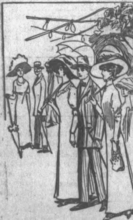
There Weren't Two Other Women in All Cairo to Compare With These Two.