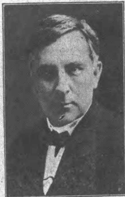
... Our Next Governor.

workmen's compensation and matters of supervision will be considered and thoroughly discussed at the national convention of the insurance commissioners of the United States which opened here today for a session extending over four days. The attendance is unusually large and the program of more than ordinary interest. The delegates from Oklahoma City, Okla., are working hard to capture for their city the next annual convention which is to be held in September, 1913.