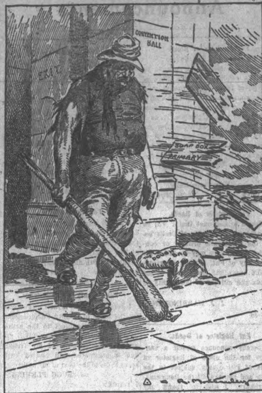
—Macaulay in New York World.