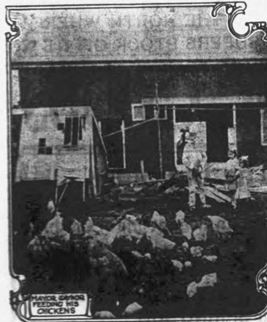
MAYOR GAYNOR FEEDING HIS CHICKENS

Early one morning as a merchant was walking downtown to open his store he said something that annoyed