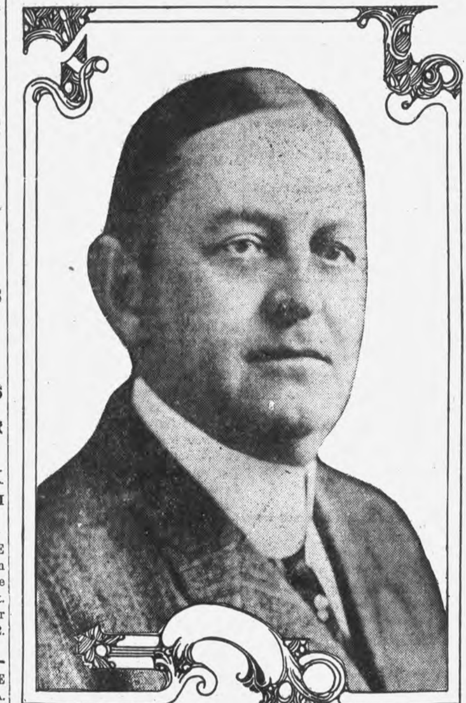
OSCAR W. UNDERWOOD, DEMOCRACY'S BEST ASSET.

"If it (the Sherman act) is enforced as a criminal statute it is an efficient instrument for preventing and punishing monopoly and restraint of trade."