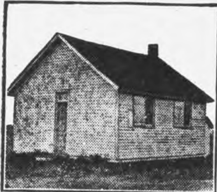
SKETEERBORO SCHOOL, ATTENDED BY THE MAYOR WHEN A BOY.

"We lived among good people, all good and industrious and frugal, and what character the sons of Oneida have here in New York city we brought with us from Oneida county. We learned in the school of experience, and now we are working down here at divers things. I am sure I am entirely content with the work I have done here. I have never aspired to this or to that. I worked at the bar, I worked afterward at the bench, and now I am doing a different kind of work. Yet it is not so different, after all, and while some people are kind enough to say that I am doing something in the office—something in the way of good government, something in the way of lifting government up and making it respectable and decent—I have only to say that I am doing nothing except