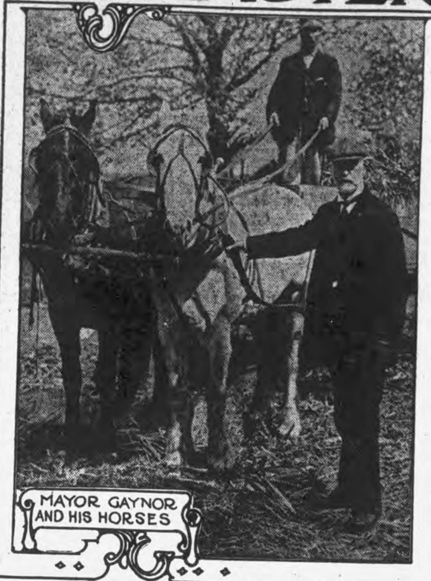
MAYOR GAYNOR AND HIS HORSES

The Joys and Trials of Life in the Country Described by Mayor Gaynor of New York, Who Gives His Definition of a "Maddler"—"Sons of Oneida"—Country Made Character and Its Work For Good Government in a Great City—Recollections of Roscoe Conkling—Skeeterboro School-house.