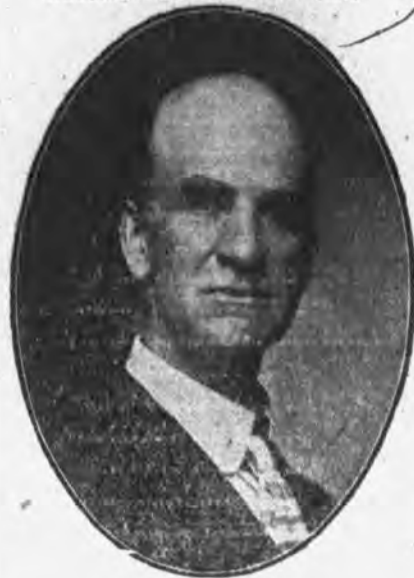
From a Late Snapshot

Consultation and Examination Confidential, Invited and FREE