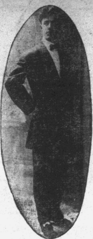
MR. LESLIE HOWARD At The Amuzu