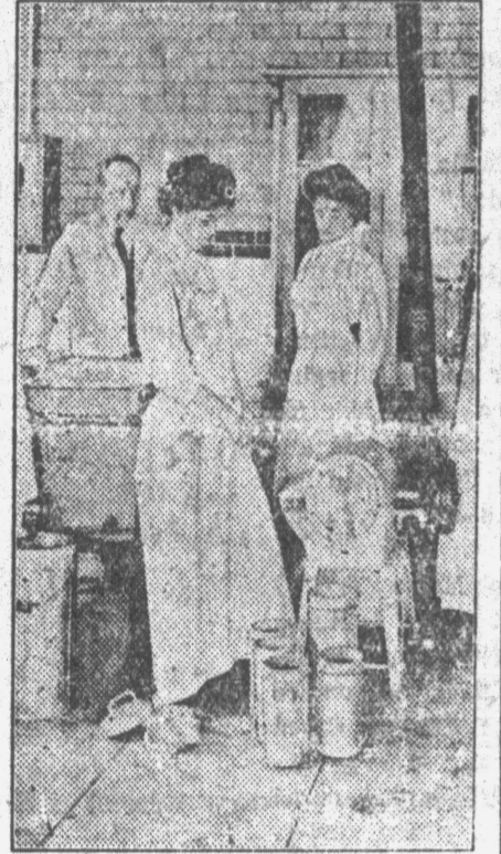
GIRLS LEARNING ICE CREAM MAKING AT A DOMESTIC SCIENCE SCHOOL.

Now that the necessity is seen steps are being taken to meet it. It was thought at first that the country boy could obtain all the education he needed in a city high school. That idea is fast being outgrown. The city high school was not created to meet the needs of the country boy, and it contains little that appeals to him. High