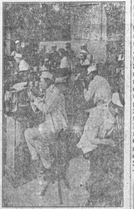
STUDENTS TESTING MILK IN A DAIRY LABORATORY.

The girl is given a large place in the secondary school as the boy. She is taught the art and the science of homemaking. She gets a