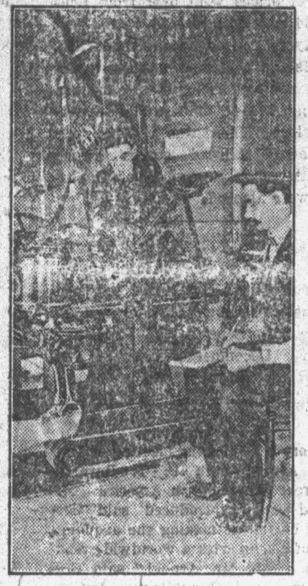
STUDYING FARM MACHINERY AT AN AGRICULTURAL COLLEGE.

The growth of the agricultural colleges was slow at first, and not until within the last fifteen years have they