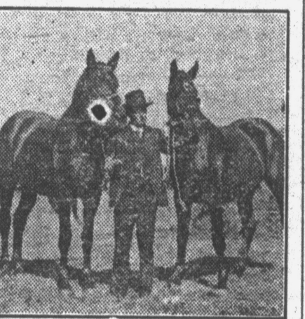
TWO OF THE MARES THAT HELPED TO PAY FOR A FARM.