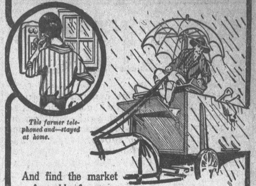
This farmer telephoned and stayed at home.