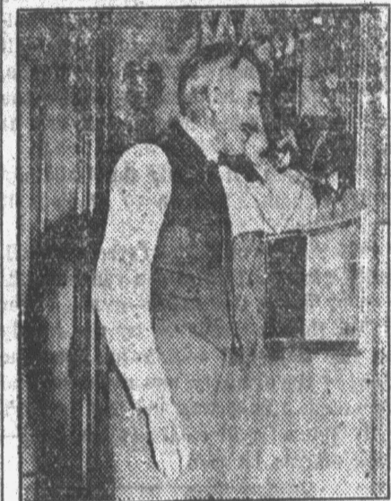
THE TELEPHONE HAS BANISHED FARM LONELINESS.

Before the advent of the rural free delivery the farmer who kept within