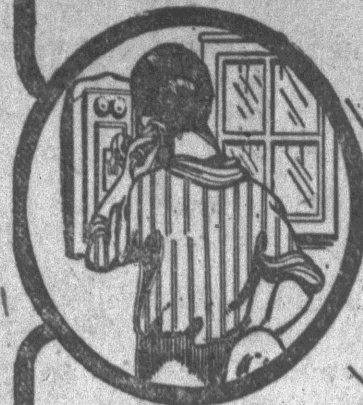
This farmer telephoned and stayed at home.