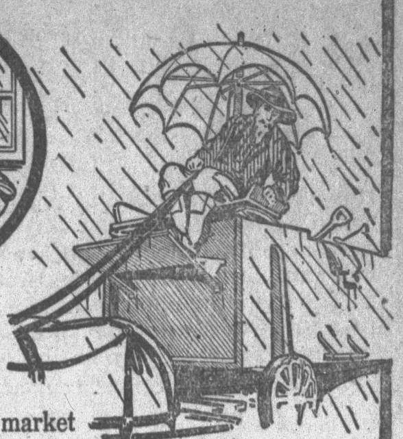
This farmer went to market.

And find the market unfavorable for your produce? The farmer who has a telephone in his home can telephone first. The useless trips thus saved are worth the cost of service.