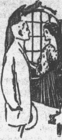
"WHAT HAVE YOU HEARD OF ME?"

elbow, his eyes glistening with eagerness.