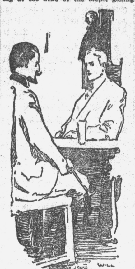
"TAKE MY ADVICE—DO NOT PLAY WITH FIRE," HE SAID.

The baron left the American standing at the head of the steps, gazing