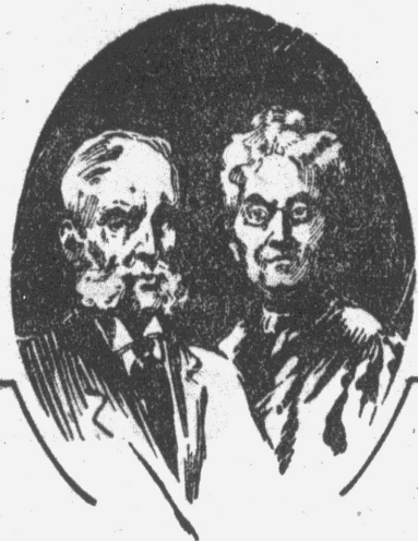
A PICTURE OF

His Neighbor. "We are told, Tommy," said the Sunday school teacher, "that we should love our neighbor. Now, who is your neighbor, Tommy?" But Tommy Tucker merely blushed, hung his head and said nothing. He didn't want to tell the little girl's name.—Chicago Tribune