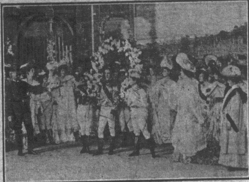
Scene in "The Runaway."