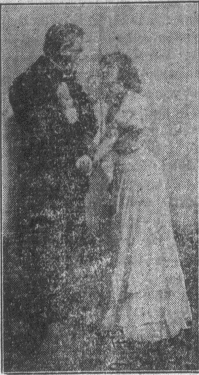
The Clansman Sept. 30th.