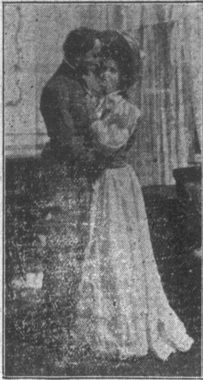
The Clansman Sept. 30th.