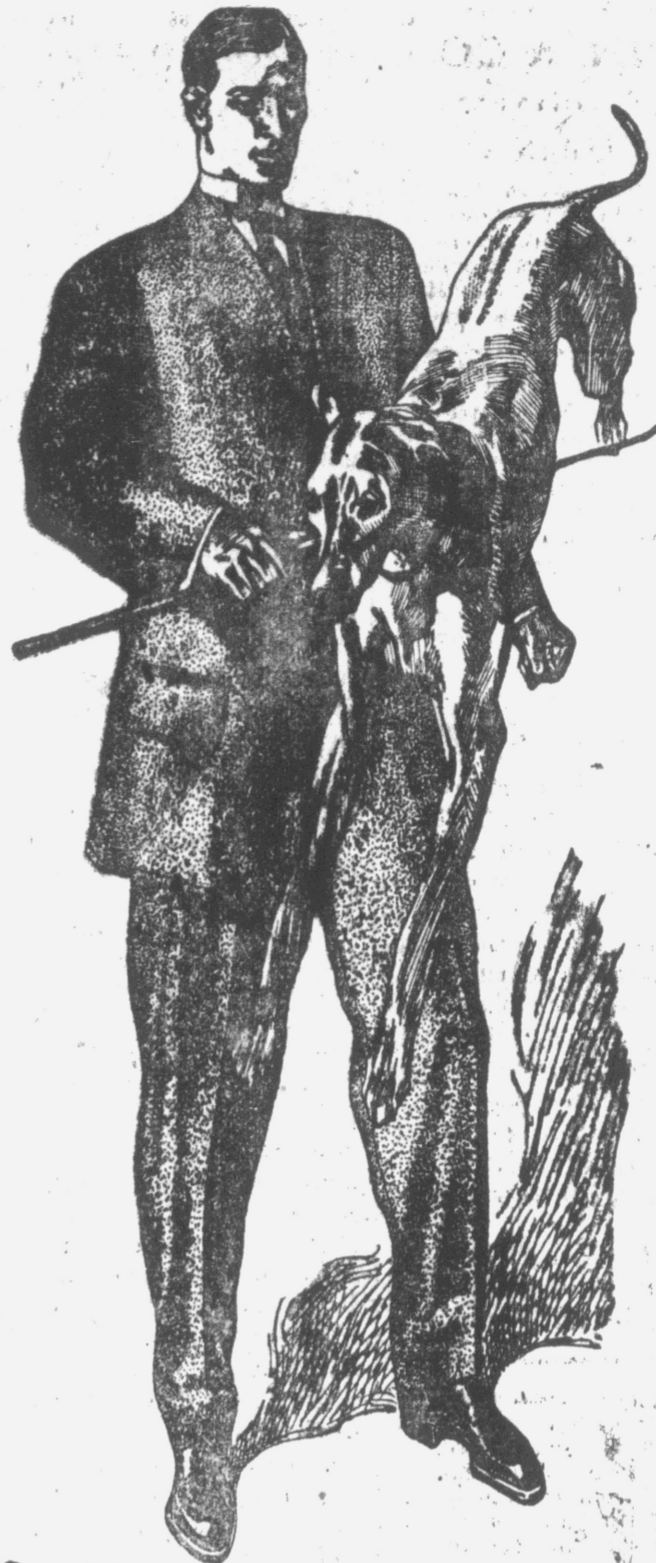
Copyright 1907 by Hart Schaffner & Marx

are ready for you now in our Store and we are going to hold a special opening re- ception to introduce you to them. You're invited; and when you come you'll meet a lot of the finest clothes you ever saw. We feel that our good friends and our good clothes should know each other better.