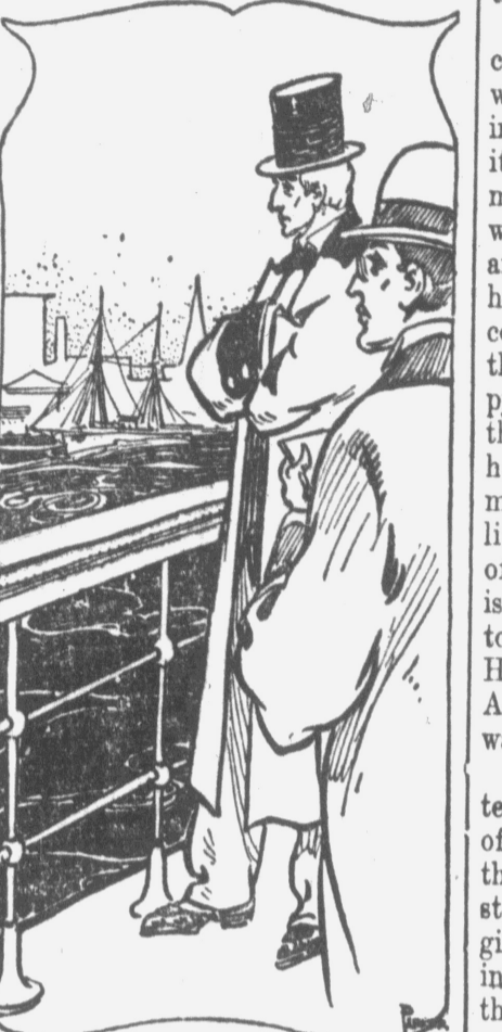
EVERTS GAZED AT THE MUDDY WATERS.