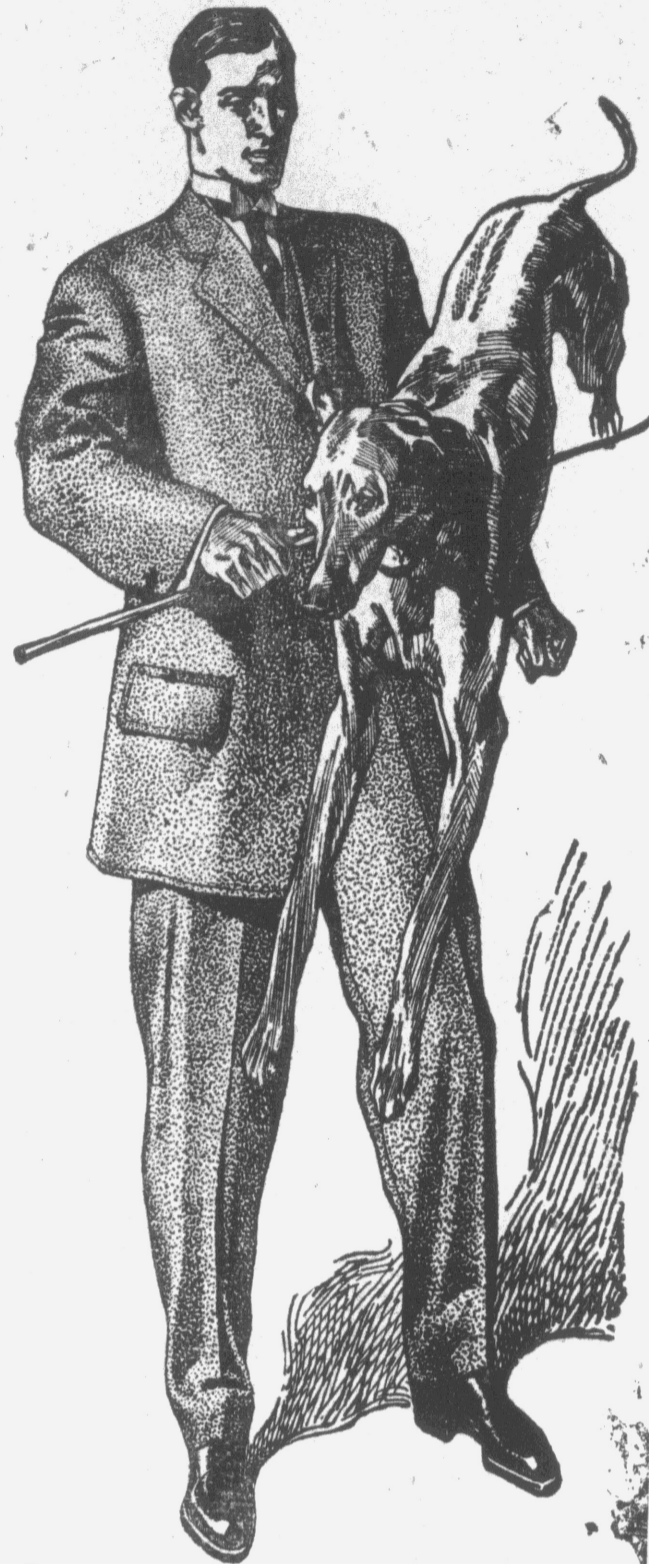
Copyright 1907 by Hart Schaffner & Marx

are ready for you now in our Store and we are going to hold a special opening reception to introduce you to them. You're invited; and when you come you'll meet a lot of the finest clothes you ever saw. We feel that our good friends and our good clothes should know each other better.