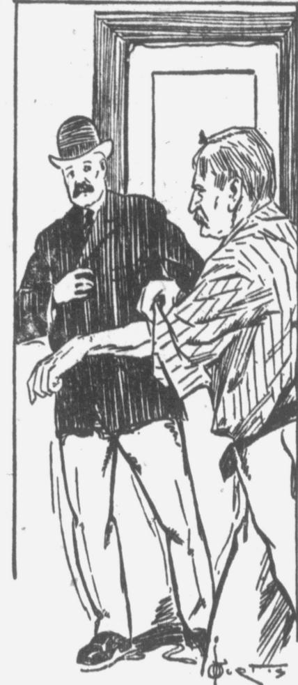
"IF YOU ARE READY, I AM."

He rose quietly, locked his office door, arranged the furniture around