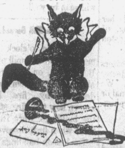
Miss Puss a letter did indite To Miss Tabby Cat; But spilled the ink, oh, dreadful plight! Her heart went pit-a-pat. —Philadelphia Record.

Sometimes the attacks are prevented or made less frequent by the wearing of a broad flannel belt over the underclothing.