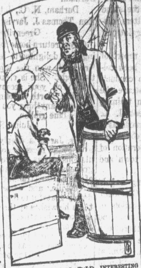
THE OLD SEA DOG TOLD INTERESTING STORIES.

The First Speech delivered by President Roosevelt. President Roosevelt made his first set speech when he was ten years old. At that time he would a bold sailor be. He had read all the marvelous tales of the sea, and his ambition was to sail the ocean blue in command of a stanch craft that would carry him to the uttermost parts of the earth. He was permitted by his governess to spend much time about the wharfs of New York, and he thus became personally ac-