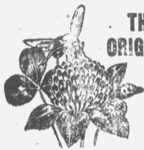
The Red Clover Blossom and the Honey Bee on Every Bottle.

"A Cold or a Cough nearly always produces constipation—the water all runs to the eyes, nose and throat instead of passing out of the system through the liver and kidneys. For the want of moisture the bowels become dry and hard." Nearly all other cough cures are constipating, especially those containing Opium. Kennedy's Laxative Honey and Tar moves the bowels, contains no Opium.