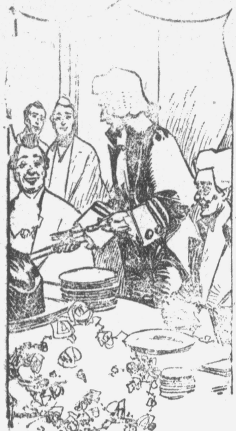
TALLEYRAND DID NOT SAY A WORD.

"I have observed the politeness in a remarkably nice manner."