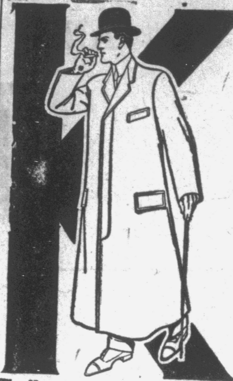
The Kenreign. A Guaranteed Raincoat

From The most inexpensive Suit or Overgarment to the costliest production on our Clothing counters, they are better values than obtainable elsewhere. The same care is taken to give our customers the best. There is not the equal of suits or Overcoats in Pitt county. It will pay you a short while to look over this line of Clothing. It means more style for you and values you don't find elsewhere. It is not possible to describe the elegance of our Clothing. You must see the line to appreciate it.