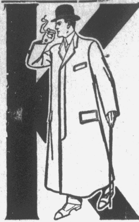
The Kenroign, A Guaranteed Raincoat

From The most inexpensive Suit or Overgarment to the costliest production on our Clothing counters, they are better values than obtainable elsewhere. The same care is taken to give our customers the best. There is not the equal of suits or Overcoats in Pitt county. It will pay you a short while to look over this line of Clothing. It means more style for you and values you don't find else;