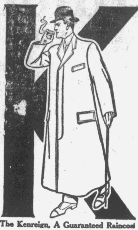
The Kenreign, A Guaranteed Raincoat

From The most inexpensive Suit or Overgarment to the costliest production on our Clothing counters, they are better values than obtainable else-where. The same care is taken to give our customers the best. There is not the equal of suits or Overcoats in Pitt county. It will pay you a short while to look over this line of Clothing. It means more style for you and values you don't find else-