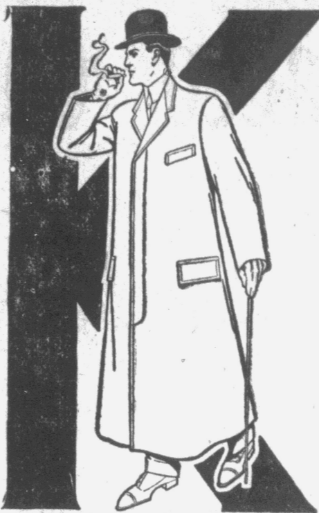
The Kenreign. A Guaranteed Raincoat

From the most inexpensive Suit or Overgarment to the costliest production on our Clothing counters, they are better values than obtainable elsewhere. The same care is taken to give our customers the best. There is not the equal of suits or Overcoats in Pitt county. It will pay you a short while to look over this line of Clothing. It means more style for you and values you don't find elsewhere. It is not possible to describe the elegance of our Clothing. You must see the line to appreciate it.