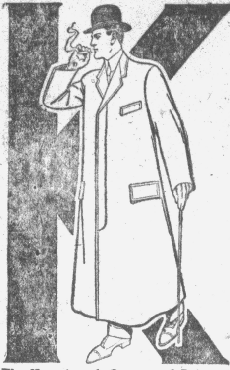
The Kenreign, A Guaranteed Raincoat

From The most inexpensive Suit or Overgarment to the costliest production on our Clothing counters, they are better values than obtainable else-where. The same care is taken to give our customers the best. There is not the equal of suits or Overcoats in Pitt county. It will pay you a short while to look over this line of Clothing. It means more style for you and values you don't find else-where. It is not possible to describe the elegance of our Clothing. You must see the line to appreciate it.