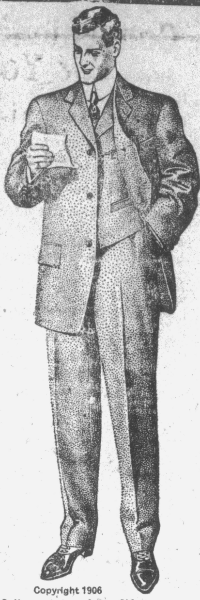
Copyright 1906 B. Kuppenheimer & Co., Chi.