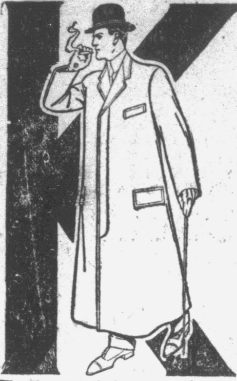
The Kanreign, A Guaranteed Raincoat

From The most inexpensive Suit or Overgarment to the costliest production on our Clothing counters, they are better values than obtainable else-where. The same care is taken to give our customers the best. There is not the equal of suits or Overcoats in Pitt county. It will pay you a short while to look over this line of Clothing. It means more style for you and values you don't find elsewhere. It is not possible to describe the elegance of our Clothing. You must see the line to appreciate it.