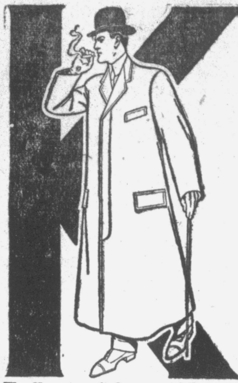
The Kenreign, A Guaranteed Raincoat

From The most inexpensive Suit or Overgarment to the costliest production on our Clothing counters, they are better values than obtainable else where. The same care is taken to give our customers the best. There is not the equal of suits or Overcoats in Pitt county. It will pay you a short while to look over this line of Clothing. It means more style for you and values you don't find elsewhere. It is not possible to describe the elegance of our Clothing. You must see the line to appreciate it.