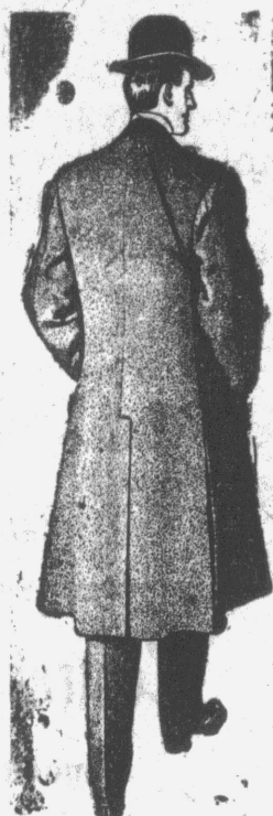
Copyright 1906, by The House of Kuppenheimer

In suits: Long Coats are the thing, with long, narrow lapels and semi-shaped backs. The newest idea is to have no vent in back, though men men prefer side or centre vents. All coats are "three button" this year, and those cut either "straight front" or nearly so, are considered the best style. Colors are mostly dark mixtures,--black, blues, and browns,--though greys are still very popular. Plain colors are always stylish.