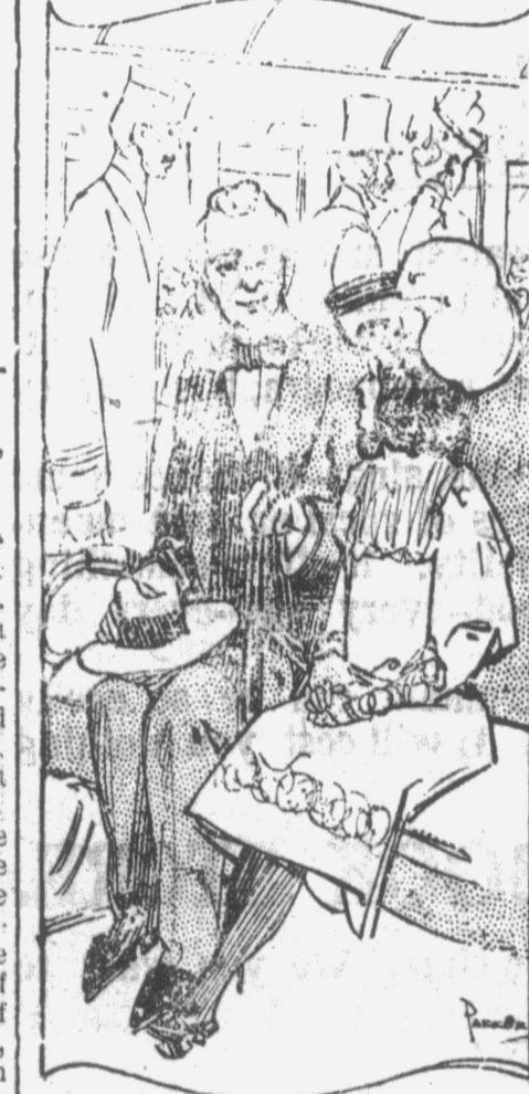
THE STATESMAN SMILED.

How a Celebrated Statesman Was Treated to a Surprise. Famous men are sometimes just like other men in the eyes of children. One day the celebrated Edward Everett was riding along a road in Massachusetts. At length a bright and sunny girl got into the cars and took the vacant seat by his side. He entered into conversation