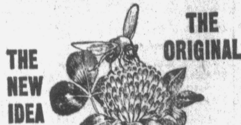
The Red Clover Blossom and the Honey Bee on Every Bottle.

"A Cold or a Cough nearly always produces constipation—the water all runs to the eyes, nose and throat instead of passing out of the system through the liver and kidneys. For the want of moisture the bowels become dry and hard." Nearly all other cough cures are constipating, especially those containing Opiates. Kennedy's Laxative Honey and Tar moves the bowels, contains no Opiates.