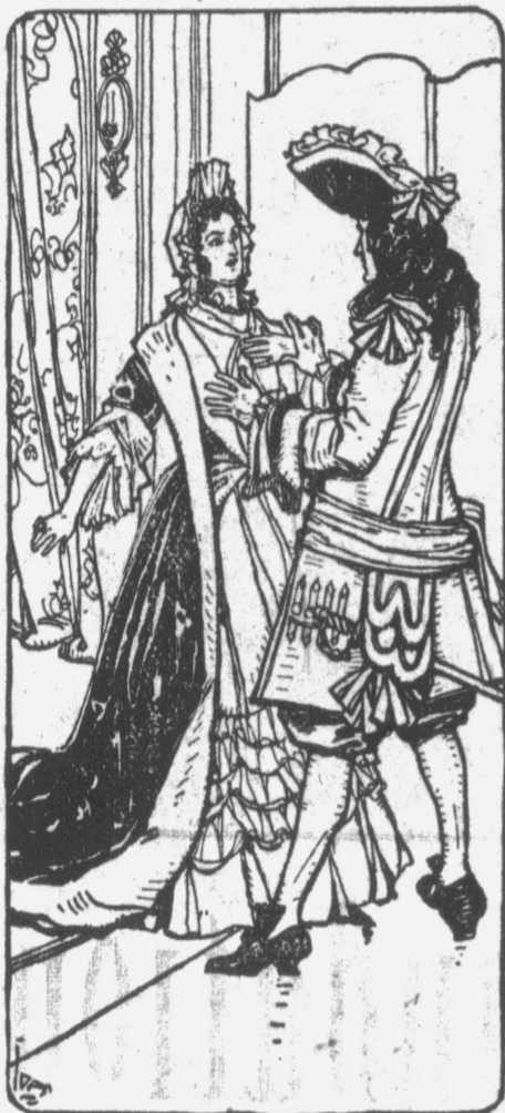
He slipped in front of her.

fuse him, madame." "You, Captain de Catinat? And by what right?" She had drawn up her superb figure, and her large blue eyes were blazing with indignant astonishment. "The king's order, madame." "The king! Is it likely that the king would cast a public slight upon my family? From whom had you this preposterous order?" "Direct from the king through Bonfems." "Absurd! Do you think that the king would venture to exclude a Mortemart through the mouth of a valet? Go, tell the king that I am here and would have a word with him." "Impossible, madame. I have been forbidden to carry a message." "To carry any message?" "Any from you, madame." "Come, captain, you improve. It only needed this insult to make the thing complete. You may carry a message to the king from any adventuress, from any decayed governess"—she laughed