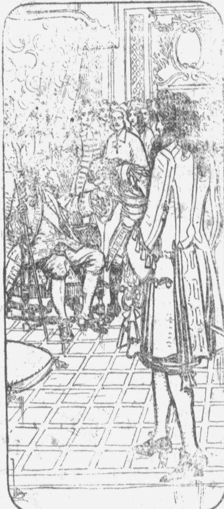
The old nobleman stooped his head and kissed the white hand.

has many brave men within his domains, but none braver than these. They have come back up the Illehois river from the Iroquois villages with their nails gnawed, their fingers torn out, a cinder where their eye should be and the scars of the pine splinters as thick upon their bodies as the fleurs-de-lis on yonder curtain."