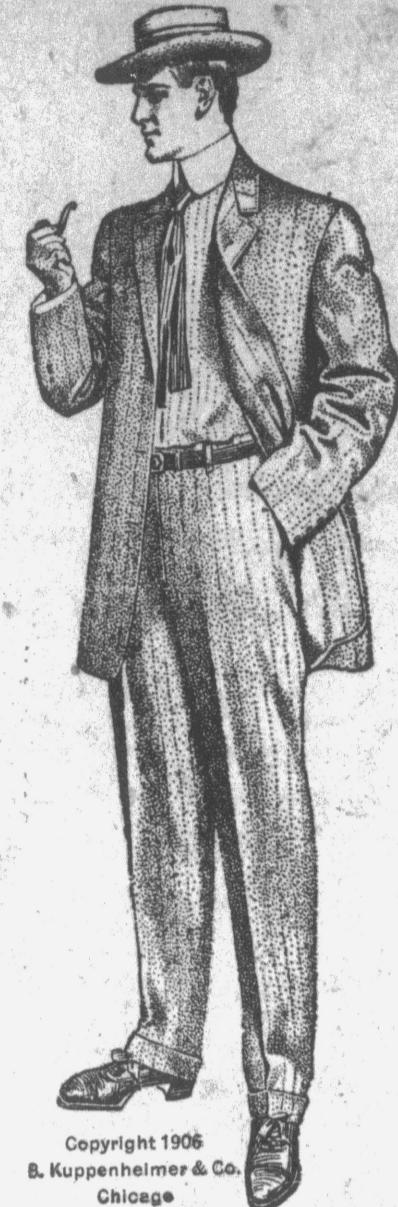
Copyright 1905 B. Kuppenheimer & Co. Chicago