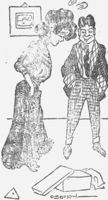
Where the Shoe Pinches.

She—I don't know what is the matter with these shoes, but they don't feel a bit comfortable.