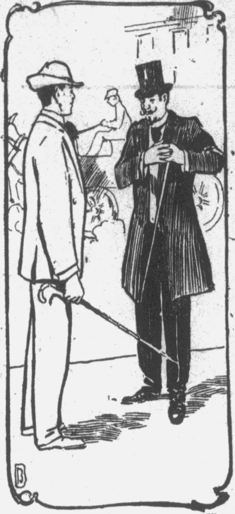
"AH, WERE YOU AT ZE FUNERAL?"