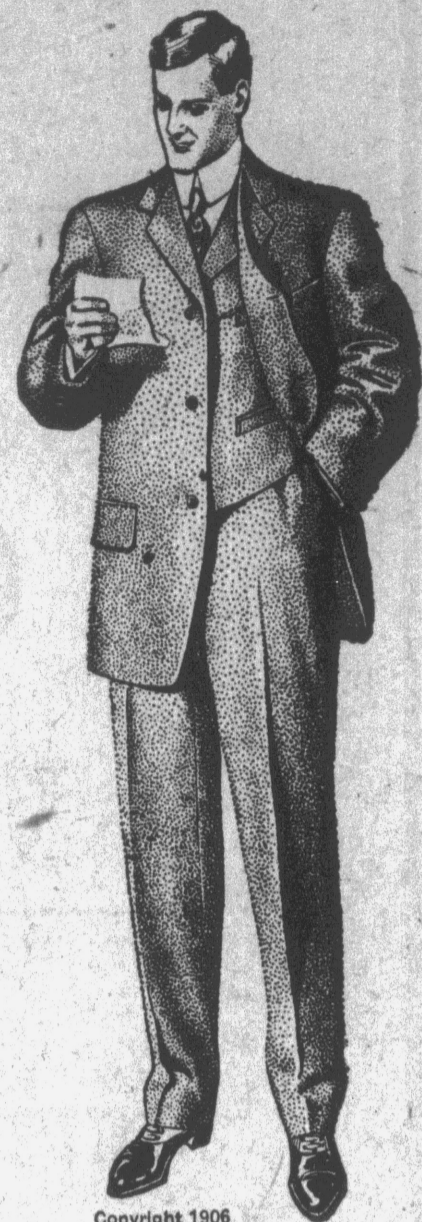
Copyright 1906 S. Kuppenheimer & Co., Chi.

We'll charge him no more than if he were a regular shape. Now, sir, if you have been troubled in getting clothes to fit you correctly we ask you to