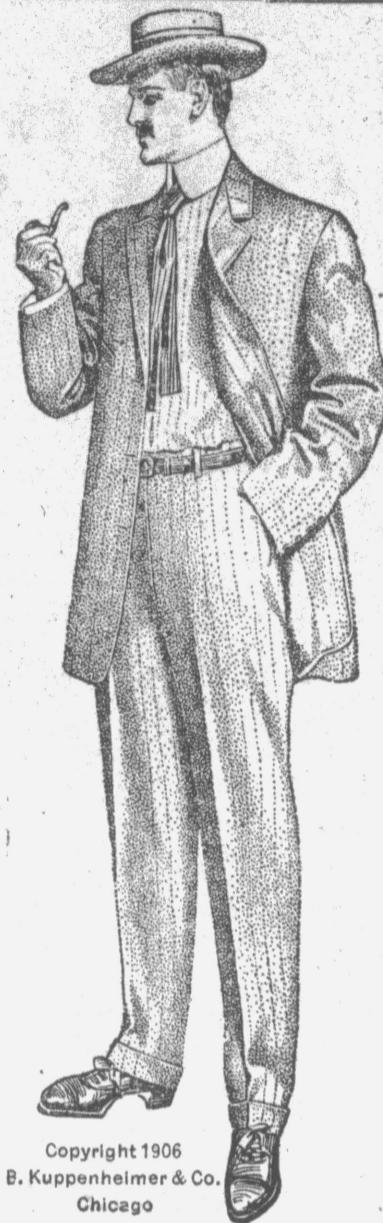
Copyright 1906 B. Kuppenheimer & Co. Chicago

We sell the solid honest work of killed Men Tailors who, while they sew the garments together, knead and work them into a shape that will stay there.