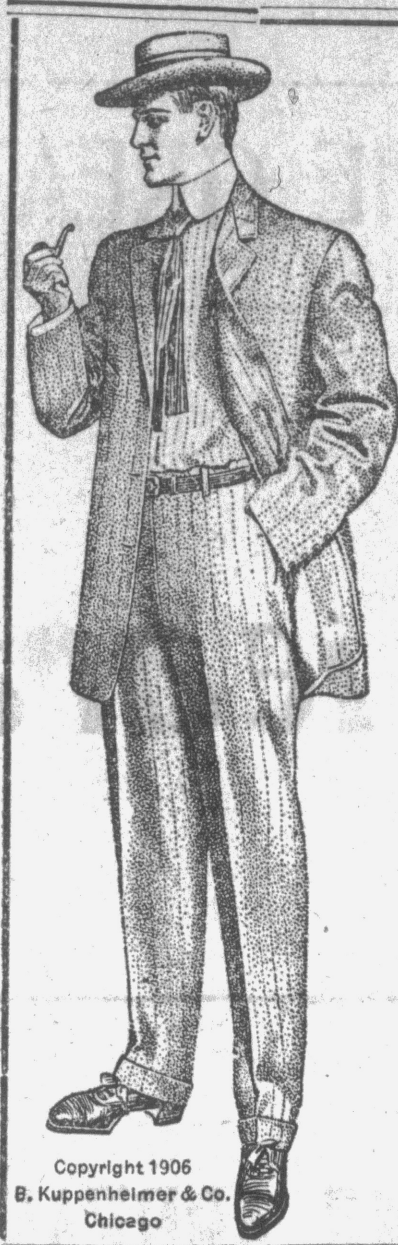
Copyright 1906 B. Kuppenheimer & Co. Chicago