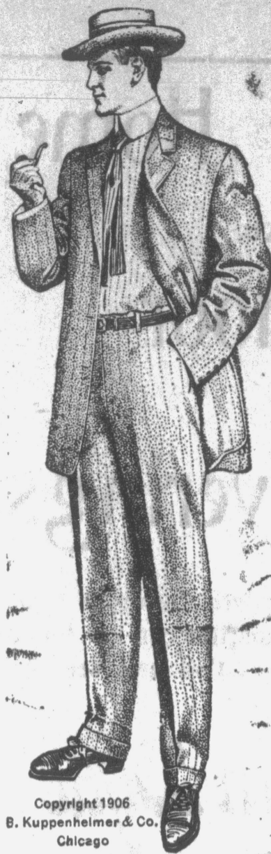
Copyright 1906 B. Kuppenheimer & Co., Chicago